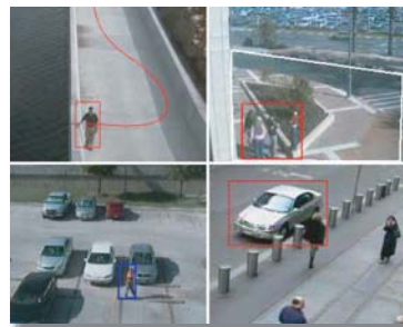
Video Content Analytics

Full Interaction with camera, including playback controls, optical and digital PTZ