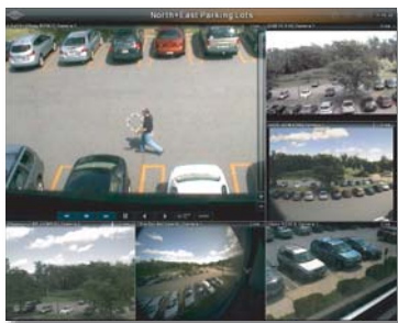
Instant Investigation during Live Monitoring

Access, investigate and export video of any incident within seconds