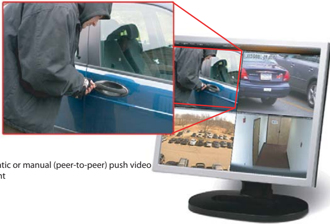
Automatic or manual (peer-to-peer) push video on-event

Video Intelligence and Content Analytics With more video content streaming from ever-growing camera systems, the need for video intelligence has become imperative. Video content analytics allow the same number or fewer security operators to address the continually growing amount of video data. OnSSI's open-standards connectivity with physical security devices enable detecting events and exceptions, based on rules, automatically and in real time. Video Content Analytics (optional) add a higher level of recognition of exceptions and movement patterns, including directional movement, unattended objects and vehicles, motion tracking, crowd behavior and more. The result is the efficient and automatic detection of events and exceptions that are streamed to users - automatically - through intelligent remote, web and mobile video clients/controllers.