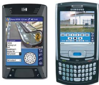
NetPDA & NetCell

PTZ-enabled Handheld IP Video clients/controllers