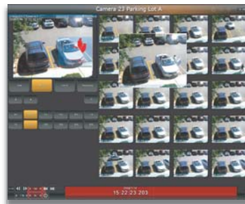
Time Slicer and Kinetic Motion Timeline

PTZ-enabled Handheld IP Video clients/controllers