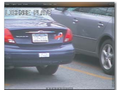
Live monitoring with instant investigation in Ocularis Client Lite

The Power of IP Video Surveillance IP-Based surveillance means that cameras can be securely monitored, recorded, administered and accessed from any authorized workstation or portable device within the local network or over the Internet. With NetDVMS, the most powerful IP-based solution by far, OnSSI has established its leadership in the new era of surveillance management systems.